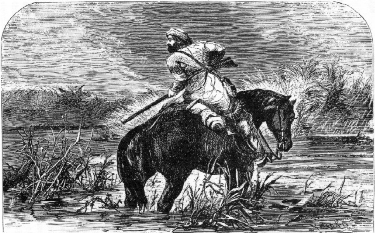
THE TRAPPER'S LAST SHOT.